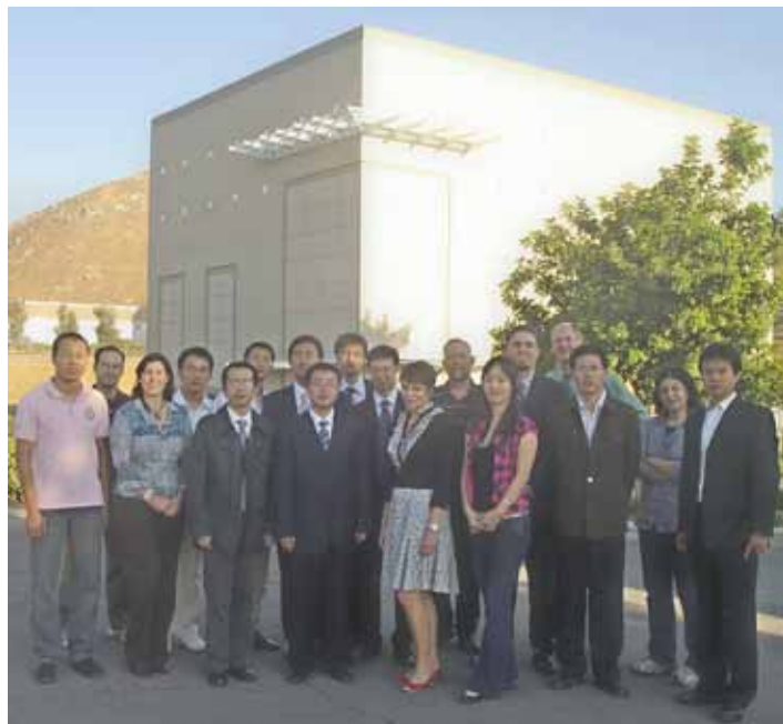
Students and faculty from Shanghai Jiao Tong University traveled to CE-CERT for the fifth research exchange between the two institutions.

presentations included reducing diesel pollution using non-thermal plasma preoxidation, and producing hydrogen by the photocatalytic reforming of methanol.